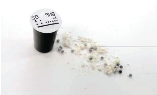
A ready-to-use "all-in-one" test cup